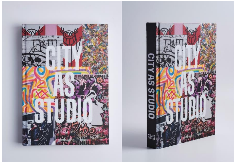
City As Studio Publication.

Online Shop Link: https://www.k11designstore.com/happenings/post/k11-art-foundation (available now)