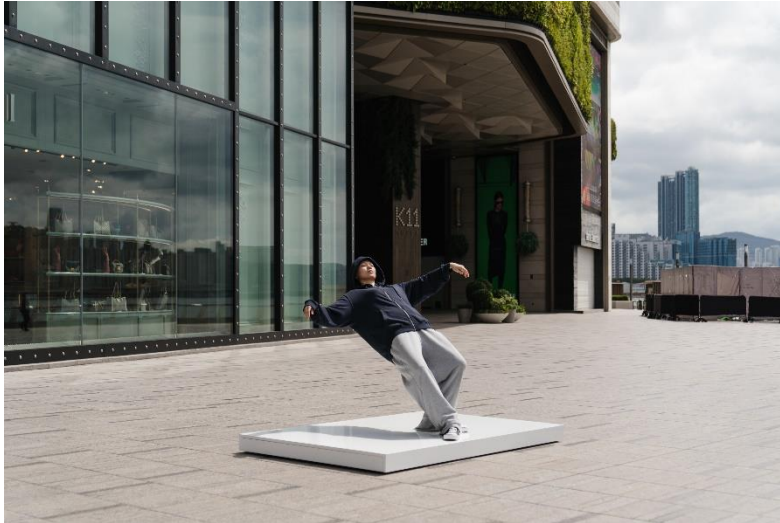
Xu Zhen's In Just a Blink of an Eye . Courtesy of K11 Art Foundation

In Just a Blink of an Eye (2005/2021) is one of the most significant artworks by Xu Zhen, a leading figure in Chinese contemporary art. In Just a Blink of an Eye explores the notion of temporality, freezing time and space by portraying a human figure that appears suspended mid-fall through means kept out of the visible eye—for hours at a time. In the presence of the work, we experience how it must feel to have time stand still, urging us to contemplate questions of personal existence and the constructed reality of the viewing experience.