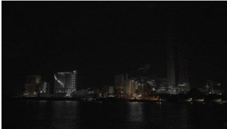
Théodora Barat's Off Power . Courtesy of the Artist

Location: Sunken Plaza, G/F Front Entrance, K11 MUSEA