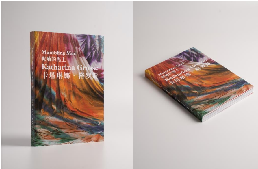
Katharina Grosse: Mumbling Mud Catalogue.

Online Shop Link: https://www.k11designstore.com/happenings/post/k11-art-foundation